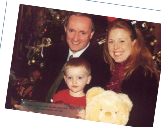
Thank you AIB