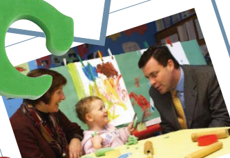
The minister visits Tallaght