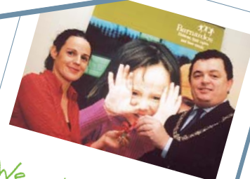
We got a new house!